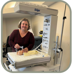
St. Francis Memorial Hospital $272,636

An ultrasound machine, baby isolette, stretchers, bi-pap machine, vital signs monitors and more.