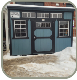
MV Hospice Palliative Care $53,044

Items such as a new loan cupboard shed and program support including volunteer training, caretaker and bereavement assistance, and more.