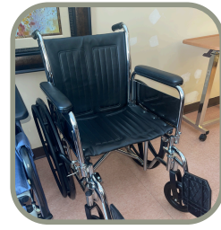
Valley Manor Long Term Care $75,012

Resident lifts, mattresses, wheelchairs, wardrobes and items for resident activities.