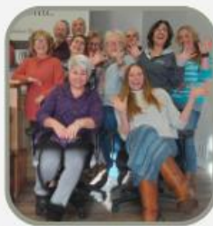
MV Hospice Palliative Care $40,342

Program support including volunteer training, caretaker and bereavement assistance, loan cupboard and more.