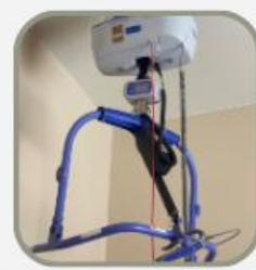
Valley Manor Long Term Care Home $29,647

Resident lifts, mattresses and items for resident activities.