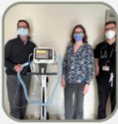
St. Francis Memorial Hospital $180,065

Because of your generous support, we provided the following grants to our partners: